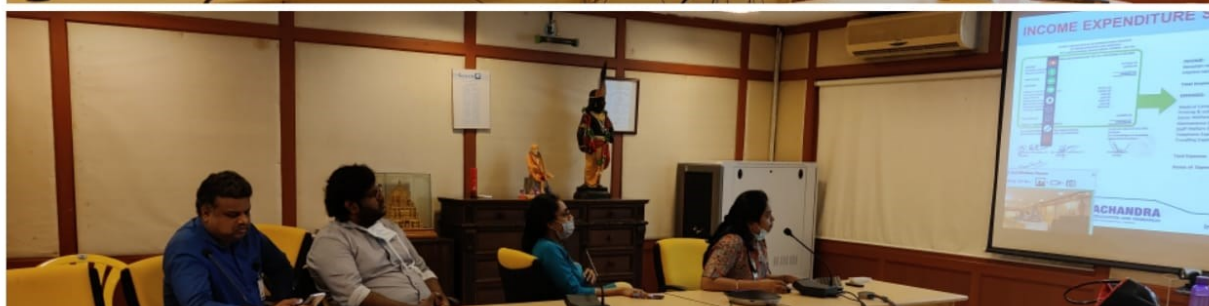
VIRTUAL PRESENTATION – GENERAL BODY MEETING