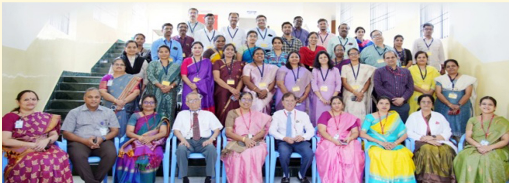
2024 B Contact Session -II (5 th - 7 th February)