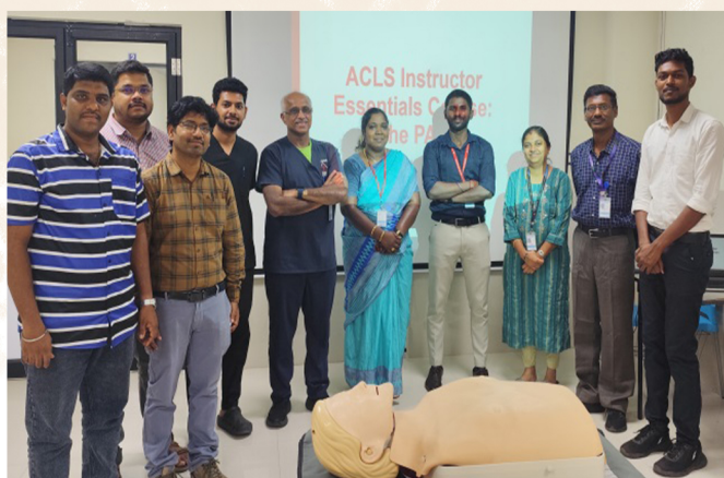
Dept. of Emergency Medicine, SRMC & RI, conducted the AHA Instructor Course on 26 th and 27 th May. Nine members attended.