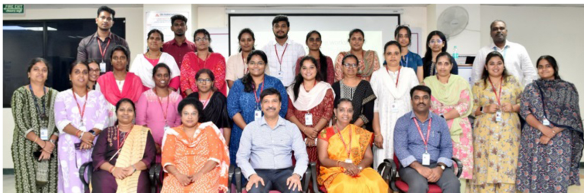
Sri Ramachandra Faculty of Allied Health Sciences (SRFAHS) Quality Cell, under the Internal Quality Assurance Cell (IQAC), organised 'Manuscript Writing Workshop' on 2 nd and 3 rd May.