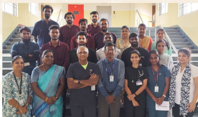
Dept. of Emergency Medicine, SRMC & RI, conducted the AHA Instructor Course on 28 th and 29 th May. 16 participants gained advanced training in emergency cardiovascular care.