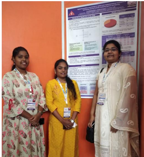
Meshavardhini R B support for travel and attending conferences scholarships awards -2020