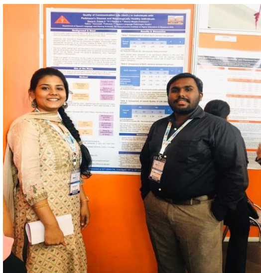
Kavya S support for travel and attending conferences scholarships awards -2020