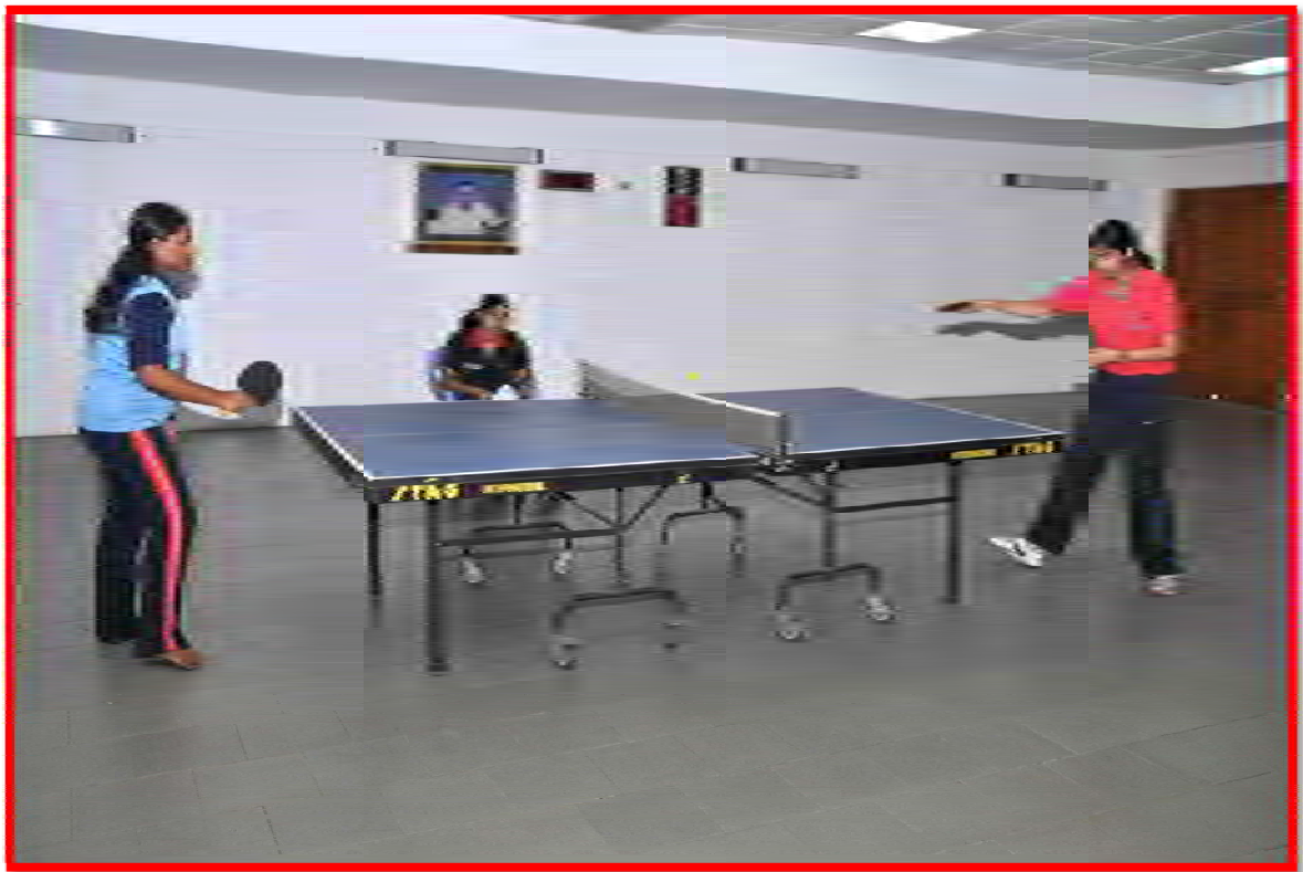
Table Tennis Court