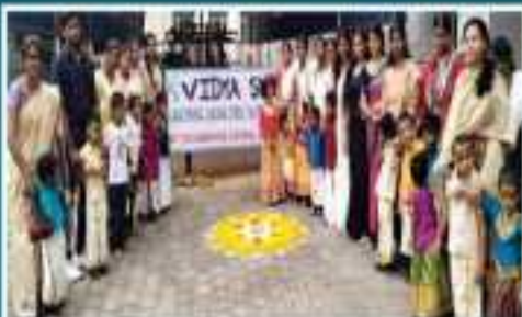
Vidya Sangham, in association with Dept. of Basic Work, Dr. Ramakrishna Faculty of Behavioural and Social Sciences (BRFSSS) organized Onam celebrations on 16 th September 2024