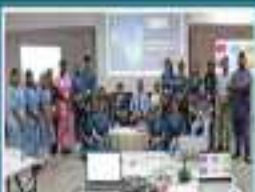
SRM RAMACHANDRA FACULTY OF CLINICAL RESEARCH