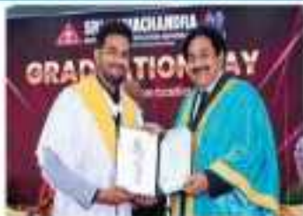
The Graduation Day for AIJ Central level Faculties was conducted on 25.04.2025.