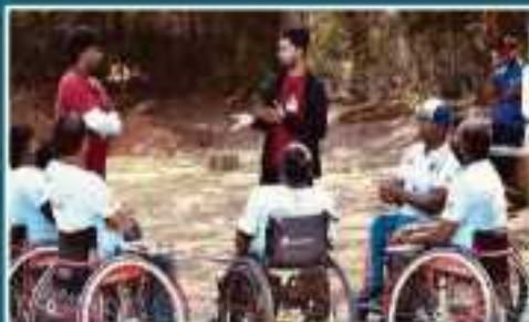
Sports Facility Inauguration from SRHAI - Thousand Sports for All at ST Madras