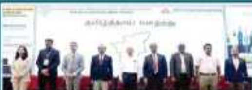
Workshop on IADR committee - First Event 2022