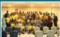
1st IADR Committee program 2022