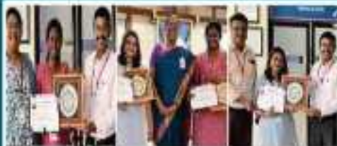
The Students and faculty members from SRFASLP won awards for scientific paper presentations at National Level Conferences in February and March 2025.