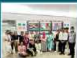
SRM RAMACHANDRA FACULTY OF CLINICAL RESEARCH