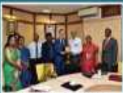
M.A. - School of Pharmacy, University of Hyderabad, Warangal