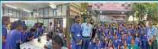
10th Anniversary of Outreach Program