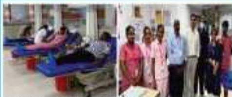
The Green Friends Organization Club of SRIHER organized the 'Veer for the Veer - A Blood Donation Drive for a Resilient Trier area' on 23 rd & 30 th January.