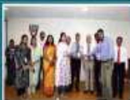
Research day 2016 Give the appreciation for authors and faculty members