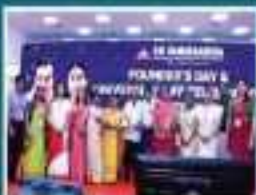
Supervisor of Microbiology, SRMIST (DLS) SRMIST (DLS)