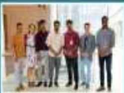
Master's Entrance Program - School of Pharmacy, University of Hyderabad