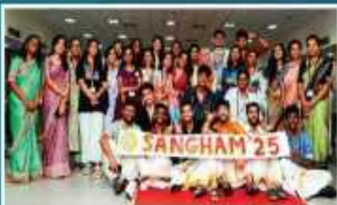
'Sangham' organized by Student Council on 10 th April to celebrate the New Year