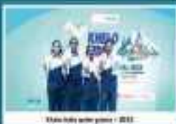
State level water polo - 2022