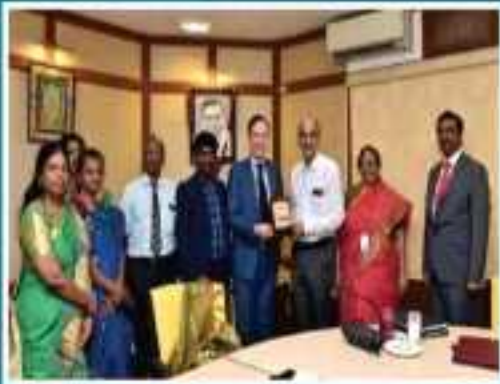
DRHEF signed an MOU with University of Cyberaya, Malacca on 26.09.2024