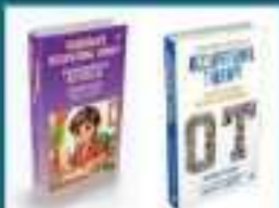
"Knowledge Shared: Strength: Empowerment: Occupational: Therapy: Book"