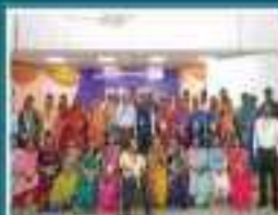
Workshop 2015 Tech Fest for Engineering for High School Students and Parents meeting