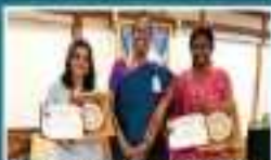
Best Paper Award for 20th National Conference of the Indian Speech-Language and Hearing Association