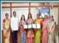
Memorandum of Understanding with University of N.T. & M.