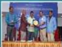
Certificate of Appreciation for SmartShed