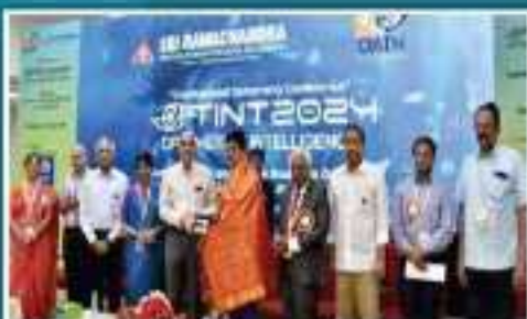
The Dept of Ophthalmology, SRMC & H conducted the 2 nd National Conference DPTINT on 31 st August & 1 st September 2024