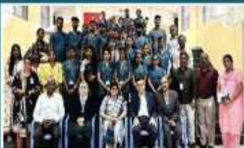
The Dept. of Biotechnology, SIHAR & I organized their 4 th Experts' Degree Graduation Studies in Pharmacology at NUS on 10 th April 2025