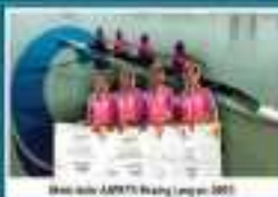
State level ADPFTS Boating League 2022