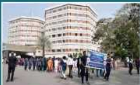
The Dept. of Prosthodontics, SRDSSH, commemorated World Prosthodontic Day on 22 nd January 2025.