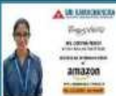
Successful pitching at E-Cell Lab at MIT