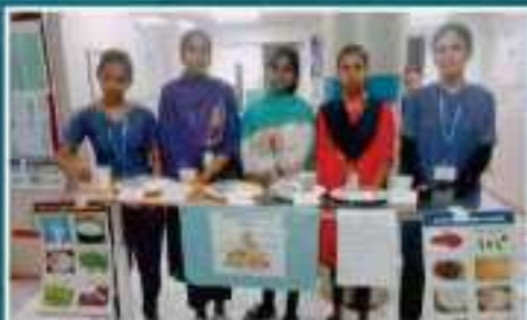
The Dept. of Clinical Nutrition, SRMANS, organised various events as a part of National Nutrition Month 'Rashtriya Poshan Maas 2024' in September 2024.