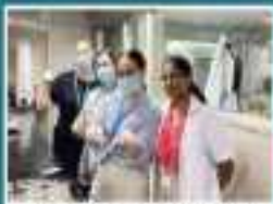
Master's Entrance Program - Sri. Jai Vidya University, Diploma School of Pharmacy, VV. (G)