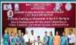
1st National Conference on Audiology & SLP