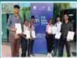
"The 100 is India" by "Program Team" - Award Ceremony