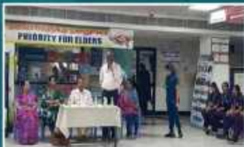
The Department of Civil Pathology and Microbiology, SPMCAH in collaboration with Indian Association of Oral and Maxillofacial pathologists observed National Oral Periapical Day on 21 st February 2025