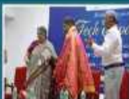
Tech Fest 2016 Project Expo Certificate Award presentation