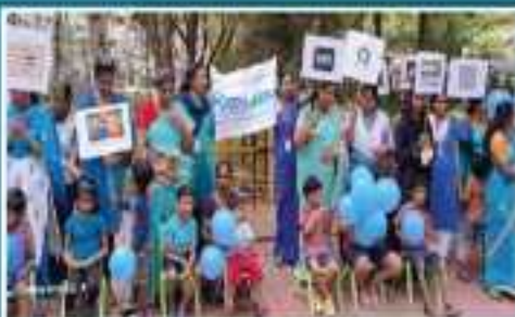
Vidya Sadhana in association with KCCDC, constituent colleges & Dept. of Social Work observed World Autism Awareness Day (WAAAD) on 2 nd April