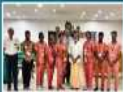
Group Photo of 2022-23