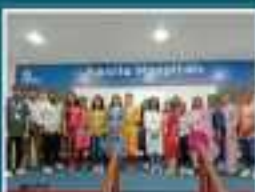
SRM RAMACHANDRA FACULTY OF CLINICAL RESEARCH