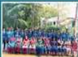
Green Chemistry Workshop on Computer Aided Drug Discovery through Green synthesis Reaction