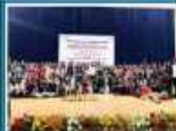
"All OT: Empowerment with innovation: Skillset: Leadership - Smart: Globalization"