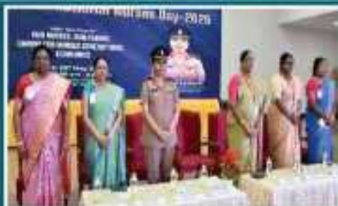
International Nurses Day Celebrations - May 2023