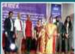
SRMCO 1001 - THE NATIONAL MANAGEMENT SOCIETY