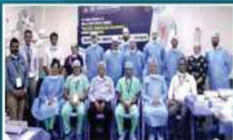
The Dept. of Oral and Maxillofacial Surgery, conducted a TMI Open Joint Surgery (Dakota Course) during the 16 th Asian Congress of Oral and Maxillofacial Surgery Conference on 24 th July 2024.