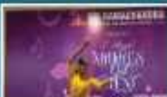
The Best edition of 'Maha's Got Talent'