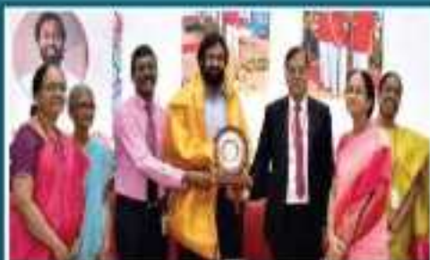
The Dept. of Obstetrics and Gynaecology, SRMC & HJ organized the 20 th PG session at one 'CG Quest 2023' from 19 th to 23 rd January 2023.