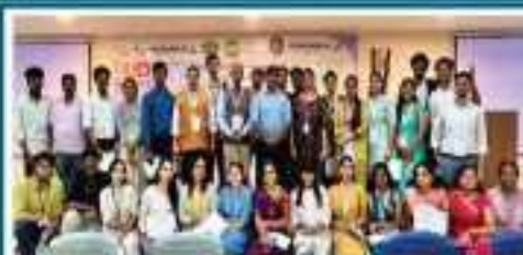
'One Health Expo 2018' was conducted for school students on 9 th November 2018 by SIRC