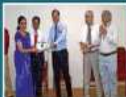
MEETEM 2016 award for Best of Physical - Engineering Project award