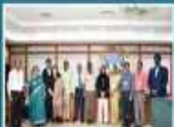
SRM with Association of Government College Academics (AGCA)