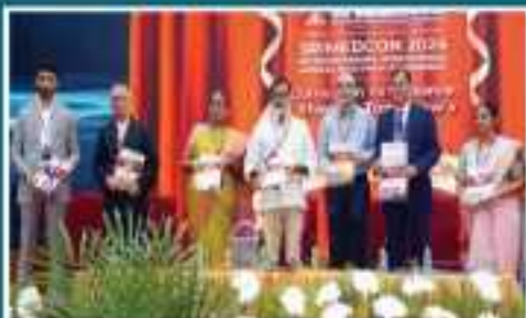
SRMC (DU) organized International Conference on Medical Education - SRMEDCON 2024 between 11 th and 13 th July 2024