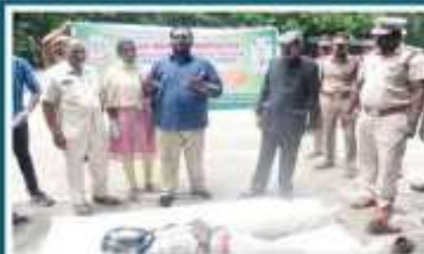
The Dept. of TCM conducted a comprehensive Basic Life Support class on First Aid, Emergency, and Pre-Hospital Care for the Officers on 2 nd September at Tambaram, Chennai