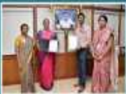
M.Phil - Diploma School of Pharmacy, Sri. Jai Vidya University