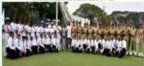
The 76 th Republic Day Celebration at SRINER (SU)