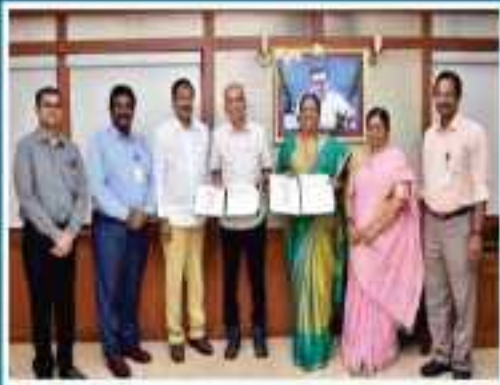
DRHEF signed an MOU with Knowledge Foundation (Dikshans), Indian Knowledge System (IKS), Chennai on 24.06.2023