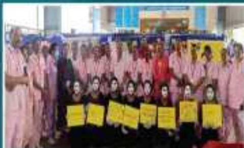
The Department of Nursing, SRM observed the World Breast Feeding Week 2024