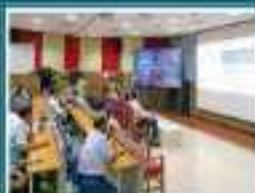
SRM RAMACHANDRA FACULTY OF CLINICAL RESEARCH