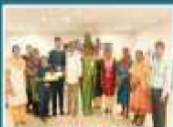
International Pharmacy Quiz 2022