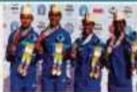
SRM National Series - Sports Development Delivery of Tamil Nadu