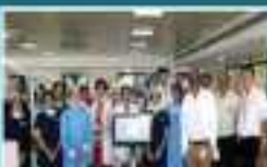
Integration of 3D in clinical course