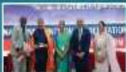
The 14th International Conference on Accreditation, Planning and Quality (APQ)