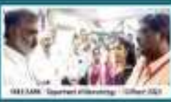
100th Anniversary Celebrations of the College Department of Neurology - 100th Anniversary 2021