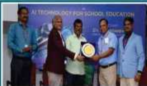
SRET, SRMISTE (DUE) hosted Academic Conference Conference on 23 rd April 2023