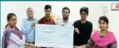
Students from SRFASLP Faculty of Engineering and Technology (SFET), secured 3 places in the 'Machinex' competition, held on 12 th December 2024 by INCO.