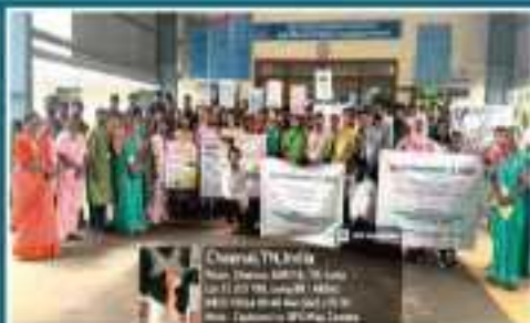
The Dept. of Pharmacy, SPMCAH observed 4 th National Pharmovigilance Week Celebration 2024 on 21 st September