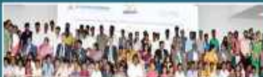
The 22nd National gathering - IADR and Technological of Success