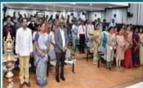
Sri Ramachandra Faculty of Engineering & Technology conducted the Conference on AI Technology for School Education.