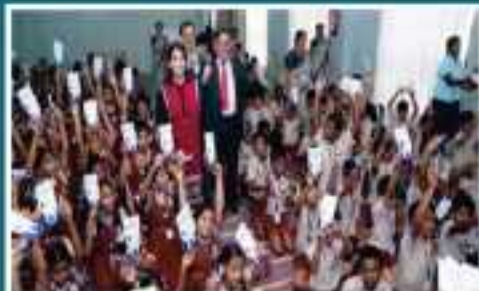
SRM in association with the Indian Dental Association, launched the National School Oral Health Program (NSOHP) on 29 th July 2024