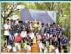
Workshop on Rehabilitation for COVID-19