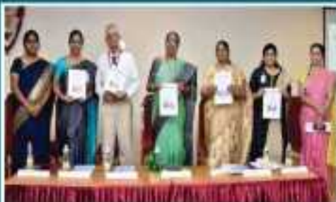
The Department of Biomedical Sciences conducted Comprehensive Workshop on Animal Cell Culture Techniques on 6 th November 2024