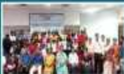
10th Anniversary of Outreach Program of EBE (ICLP)