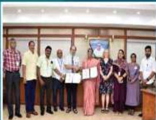
SBHER signed an MOU with Columbia University, New York, USA