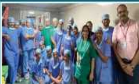
Dept. of General Surgery, Dr. Haraschandra Medical College & Research Institute hosted a two days workshop on bridge Coloproctology