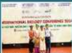
Trophy for 1 st position for research paper titled "Synthesis and characterization of polymeric hydrogel" in a symposium