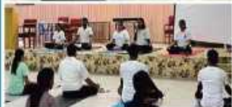
International Yoga Day 2025