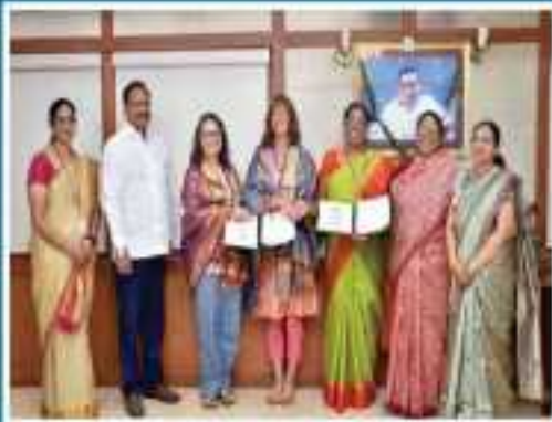
SBHER signed an MOU with University of Hull, United Kingdom