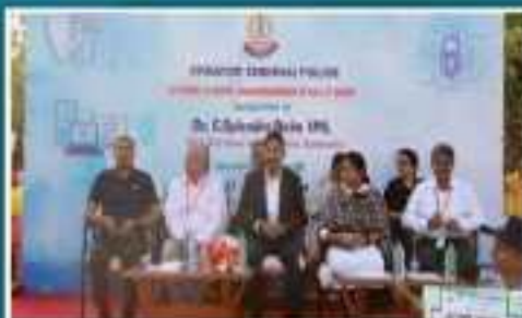
SPRIT, I NIPER conducted Cybersecurity Awareness Rally in association with Chennai Police