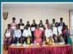
"Your Dreams: Strength in Action: Performance: Commitment"