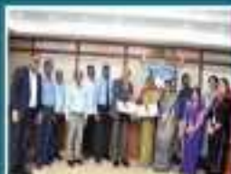
SRM RAMACHANDRA FACULTY OF CLINICAL RESEARCH