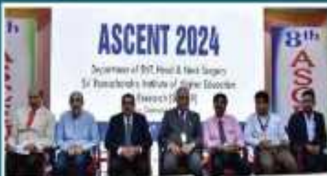
The Dept. of ENT, Head & Neck Surgery, SIHAR & I hosted ASCENT 2024 from 11 th to 14 th July 2024