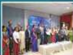
Inauguration of SRM RAMACHANDRA FACULTY OF CLINICAL RESEARCH