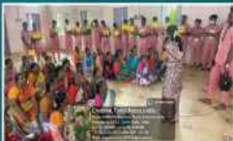
The Day of Community Health Hearing. SRHAI celebrated National Pulsion Prevention Day on 10 th December 2024.