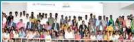
Registration of Department DM Care - Centre of Excellence