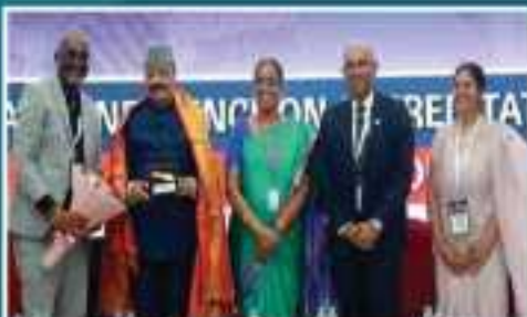
The First International Conference on Accreditation, Research, and Quality (ARQ) was organized from 19 th to 21 st June 2020.