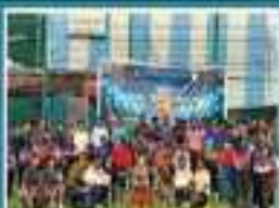
"Unity: Cooperation & Partnership: Collaborated Together"