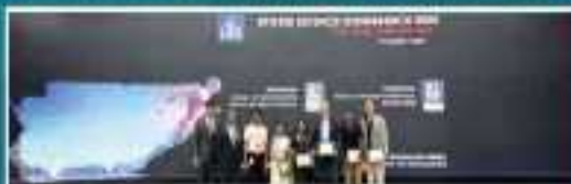
Sports Science International Conference 2020 of IAFSS