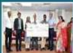
SRM UNIVERSITY COLLEGE IN COLLEGE STATE CONVENTION