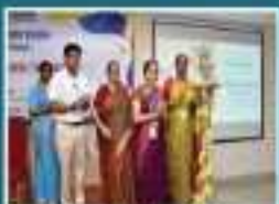
SRM POLINA AWARD, DISTRICT LEVEL (2022-23)