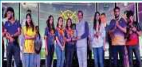
SAC (Rotaract Club) SRIHER won the Best Presentation Award and CRR Special Recognition Award during the District District meet on 12 th December 20.