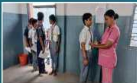
The Urban Health and Training Centre, Dept of Community Medicine, in collaboration with the Dept of Public Health Dentistry, organized a School Health Programme on 20 th February 2020