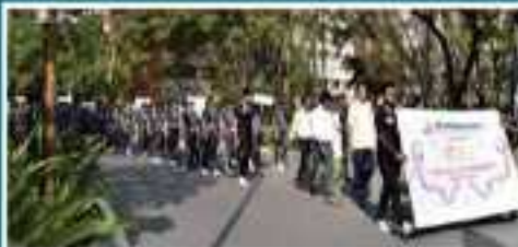
In Bharathiartha Faculty of Occupational Therapy organized rally to commemorate World Cancer Day on 4 th February 2023