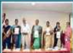
Organizational Workshop on Green Cellulose Technology