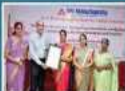
Third NIP 2 (Postgraduate) Extension Scheme - August 2020