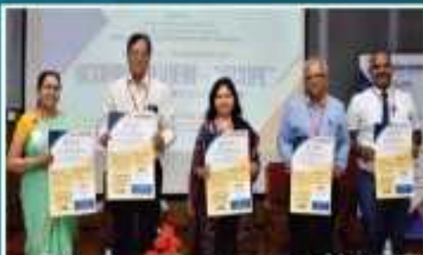
SIPOC conducted a two-day National Workshop on Scoping Review (SCOPRS-2023) on 2 nd & 3 rd May 2023, organized by the Technical Resource Centre (TRC) and funded by the Centre for Evidence Based Guidelines, Department of Health Research (DHR), M&ITW, Govt. of India