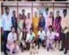
Student winners at various national, state, district and inter-university level events in cricket, badminton, table-tennis, basketball, football, cricket, table-tennis, etc.