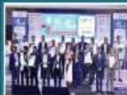
"Innovation: Empowerment With Continuing Learning: Growth"