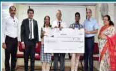
SIPMS hosted the Sri MPV Bazaaring Udyog Jan-School Debate Competition for school students on 23 rd October 2018