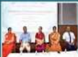
Quality Improvement Programme - February 2020