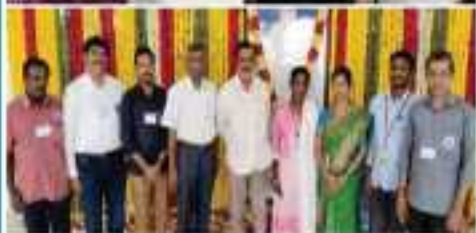
Free Multidisciplinary Camp at Rajapuram in September 2024