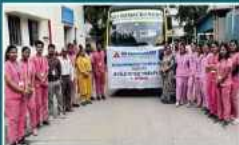
The Dept of Complementary Physiotherapy organized a community health camp Treaty to FIT on 2 nd September 2020