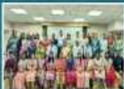
Meeting on advanced materials being synthesized using green chemistry on 26th October 2022