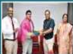
Quality Improvement Programme - June 2020