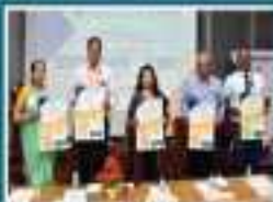
National NIP (Nurses) Training Scheme 2019-2022 - May 2020