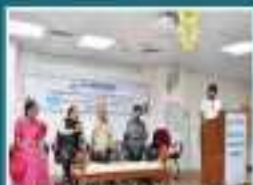
AWARD OF HON. SUPRE. DISTRICT & District Collector Management (2022-23)