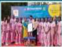
Workshop on Rehabilitation for COVID-19