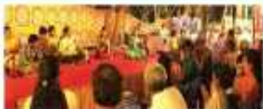
The Music Club of SRIHER in association with Rotaract Club organized 'Mandala Peep' on 2 nd April.