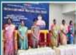
International Nurses Day Celebrations - May 2020