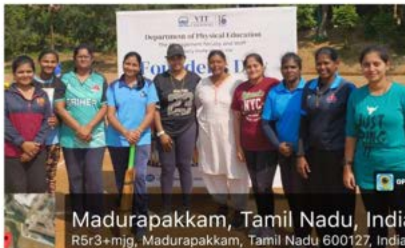
Madurapakkam, Tamil Nadu, India R5r3+mjg, Madurapakkam, Tamil Nadu 600127, India